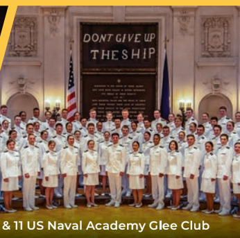
3/10 & 11 US Naval Academy Glee Club

PURCHASE TICKETS ONLINE OR BY PHONE 480.422.8449 | AZMUSICFEST.ORG