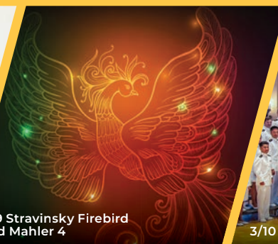
3/9 Stravinsky Firebird and Mahler 4